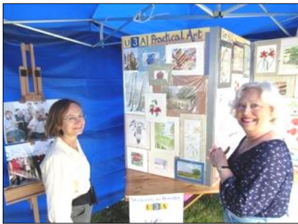
The group's exhibition of artwork West Horsley Fete-September

We had a wonderful reception at the West Horsley Fete in September, where we displayed